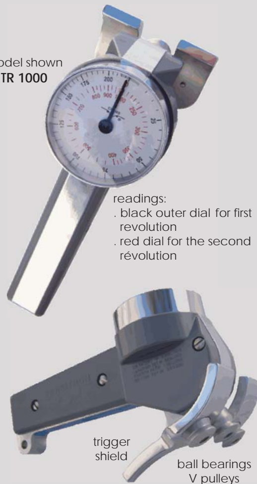
model shown TR 1000